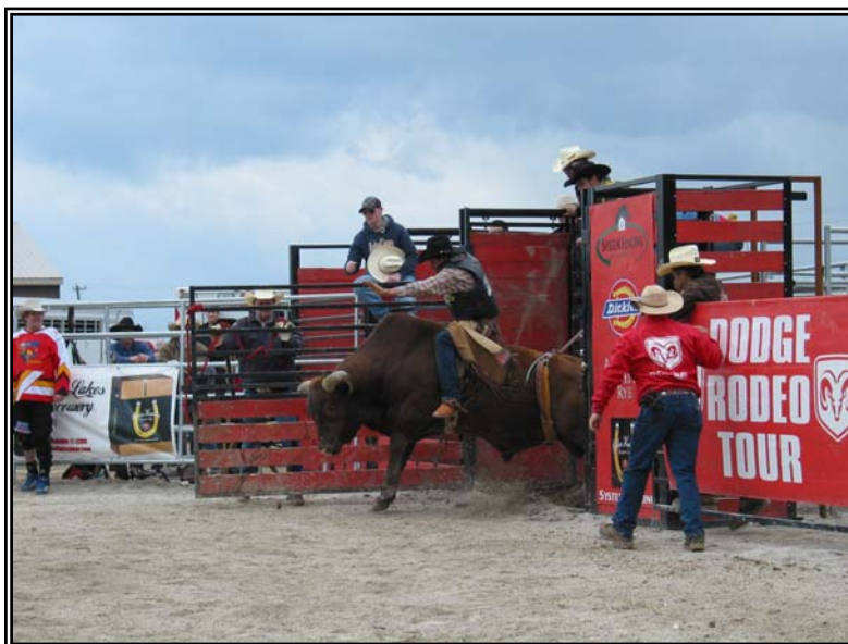
Cowboys compete for $1,000 Jackpot in the Dodge Rodeo Bull Buckout at System Fencing in Rockwood.